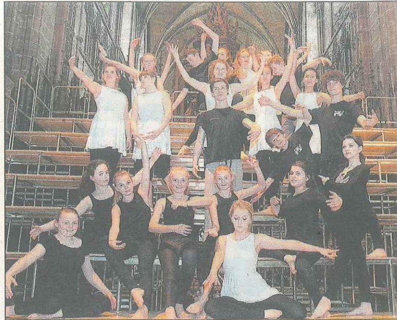
MYSTERY PERFORMANCE: Homegrown Youth Dance Theatre at Chester Cathedral. Pictures: IAN COOPER IC100513dance-05

SMILES on the faces of hundreds of school children last Friday night said it all at a Mini Mysteries performance at Chester Cathedral.