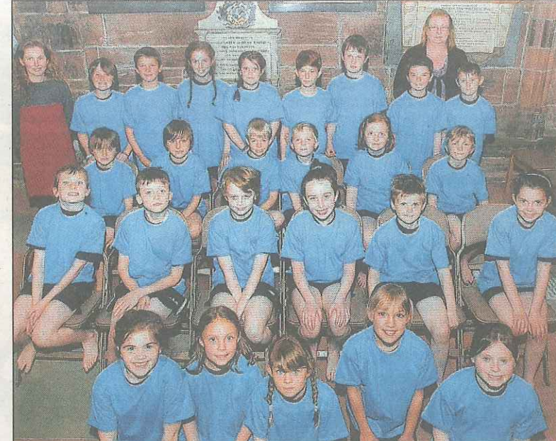
LET THERE BE LIGHT: The youngsters from Dodleston Primary School. IC100513dance-01